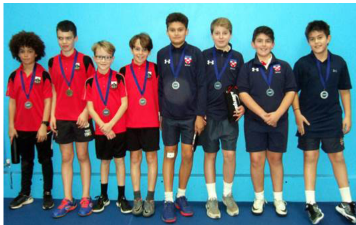
Alexandra Park left and Mill Hill right

In the Boys Under 13 event there were nine teams competing but the two outstanding teams who came through to the final were Mill Hill School (Barnet) and Alexandra Park School (Haringey). In the Final, neither team was ever more than one set ahead and the final result was a 4-4 draw. To decide the winners, it then went to count-back on games won and lost but these were also equal. A very tense wait was necessary, as it then went to a count-back on individual points won and lost, resulting in a victory to Alexandra Park School by 252 points to 228, a margin of just 24 points spread over about 20 games!.