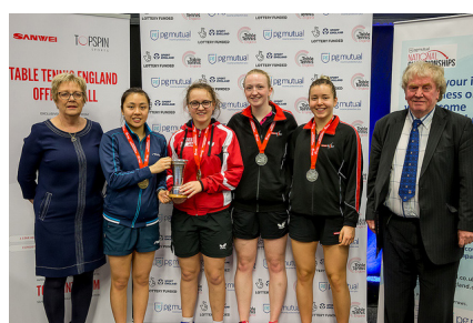
Womens Doubles Medal Presentation