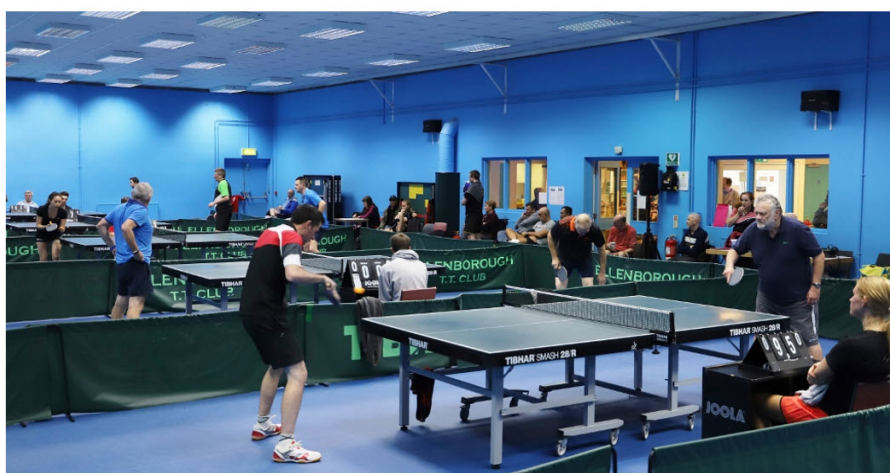
Competition in Full swing

For more information email: etcpingpong@gmail.com .