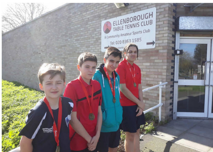
Winners of Division 1 : Ellenborough A