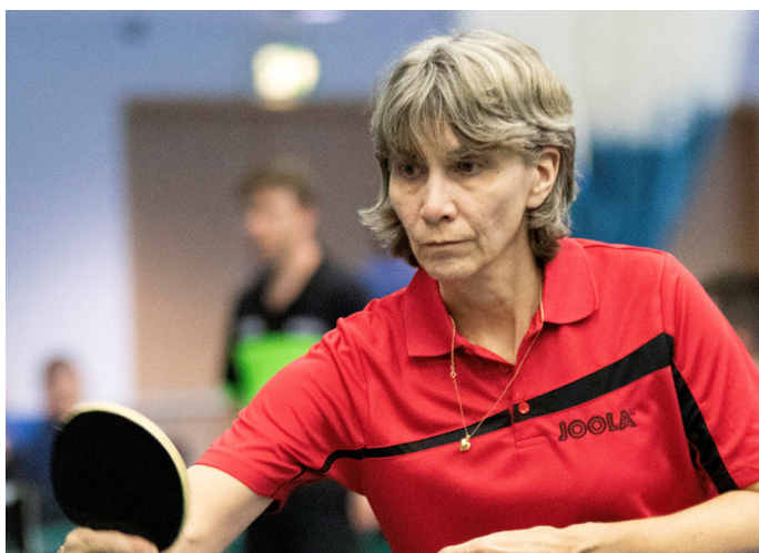
Faith by Melvyn Lovegrove

https://www.tabletennis365.com/BritishLeague/Tables/Veteran_Womens_2018-19/Division_1_(Completed)