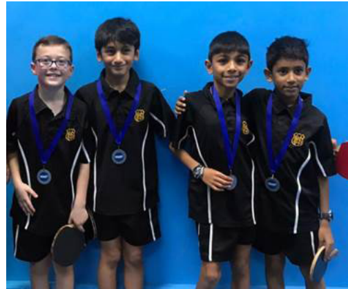
Holland House School

In November 2018 we hosted the North London Schools Team Championships, which were attended by 146 players from sixteen schools across Enfield, Haringey, Barnet and Waltham Forest. There were eight events, four age groups for Girls and the same for Boys. Winners in the Girls events were Whittings Hill Primary (Barnet) in the Under 11, JCOSS (Barnet) in the Under 13 and the Under 16 and Kingmead School (Enfield) in the Under 19.