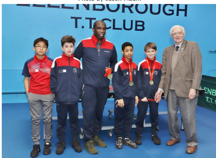
Winners of Division 3 : Fusion TTC 1