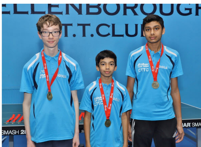
Winners of Division 4 : Chelmsford B