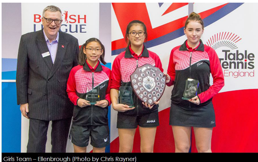
Girls Team – Ellenborough

So all to play for on weekend two when Ellenborough will face both of the Burton Uxbridge teams, before they split into the mini round robin.