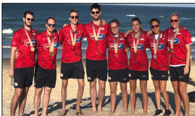
Men's and Women's Squads on the Beach with their Bronze Medals