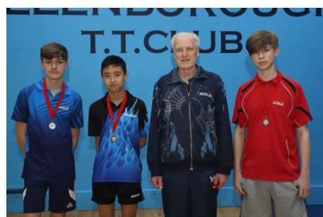
Div. 2 Winners Brentwood