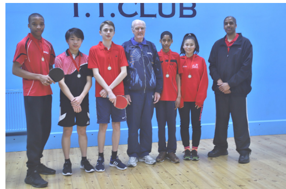
Div. 2 Winners Ellenborough B