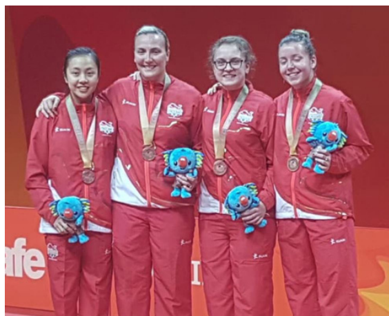
After Receiving Their Bronze Medals