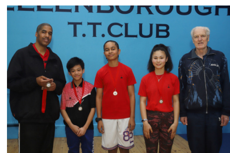
Div. 3 Winners Ellenborough B