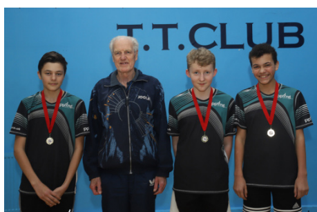
Div. 1 Winners The Reach Academy A