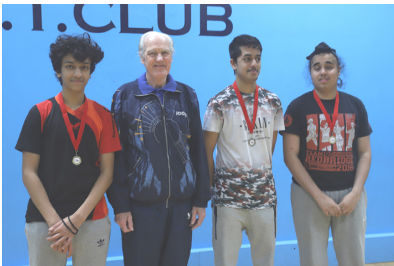
Div. 1 Winners Mossford A